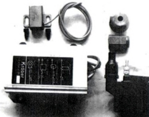
STANDARD COMPLETE BC ART.100057 15° COMPLETE BC ART.100058 20° COMPLETE BC ART.100059